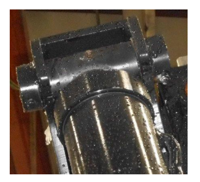
4) Draw Bar has 1 grease zerk in the center